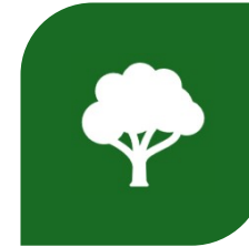
SOCIAL ENTREPRENEURSHIP & COMMUNITY