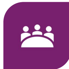
CONSERVATION & ENVIRONMENT