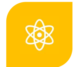
SCIENCE & TECHNOLOGY